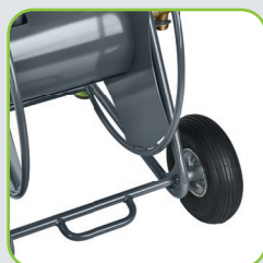
Ergonomic construction: comfortable rolling