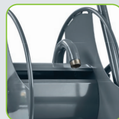
Hose protecting drum