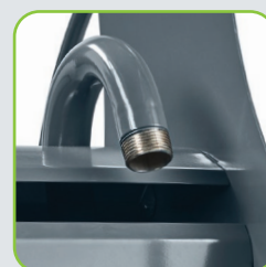
180° curved intake tube prevents the hose from kinking