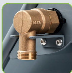
GEKA® plus rotary fitting for drinking water