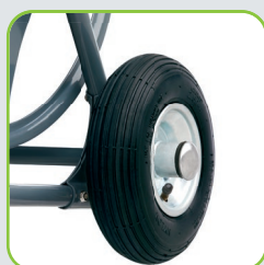
Air-filled tyres for comfortable rolling